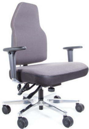
Bariatric Plush 250