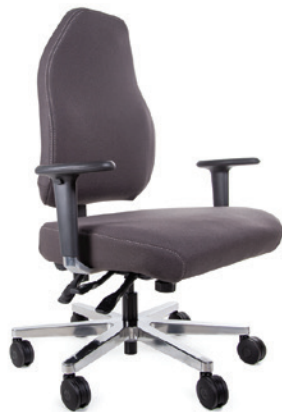
Bariatric Plush Elite 250