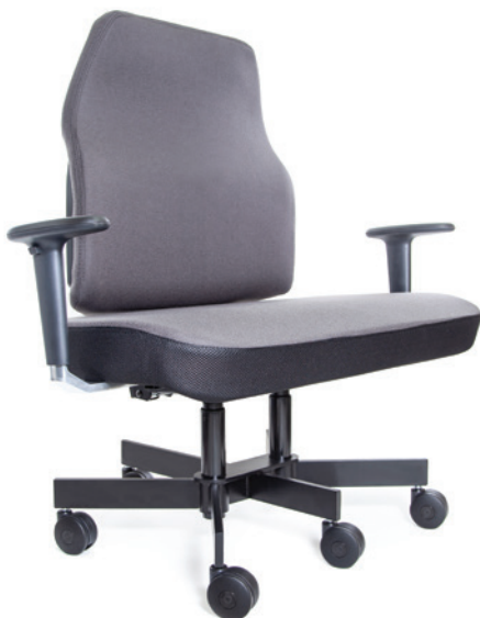
Bariatric Plush Elite 300