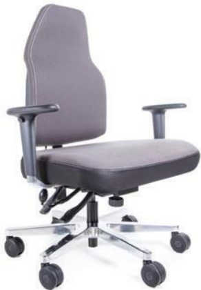
Bariatric Plush 250