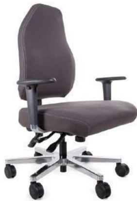
Bariatric Plush Elite 250