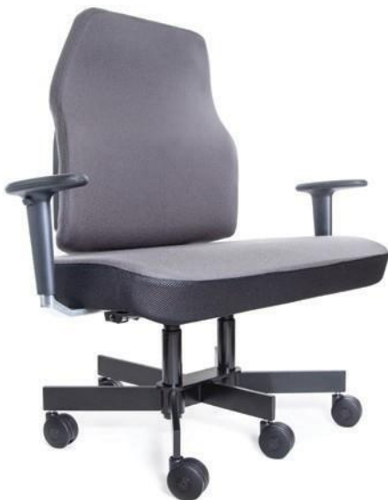
Bariatric Plush Elite 300